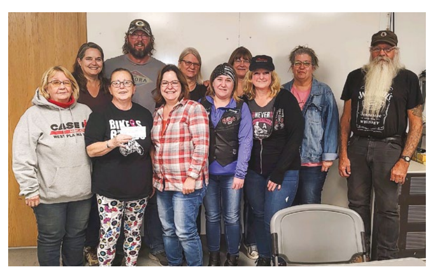
The Lower Yellowstone chapter of ABATE received a $500 check from the Operation Round Up Trust to go toward its annual toy drive. ABATE uses the funds it receives to buy toys and gifts to be handed out at the Gifts from the Heart program. Last year, it helped 164 families with 496 kids.