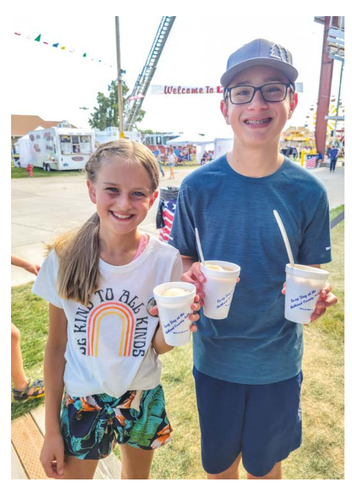
LYREC, along with six other local cooperatives, served over 400 popsicles and 900 root beer floats at the Richland County Fair and Rodeo Aug. 4.

Eligibility is based on your household income and resources. If you reside in Montana, you can contact Energy Share at 800-227-0703. If you live in North Dakota, you can contact Community Action at 701-572-8191. You may also download an application at www.lyrec.coop or call Lower Yellowstone Rural Electric Cooperative for more information.