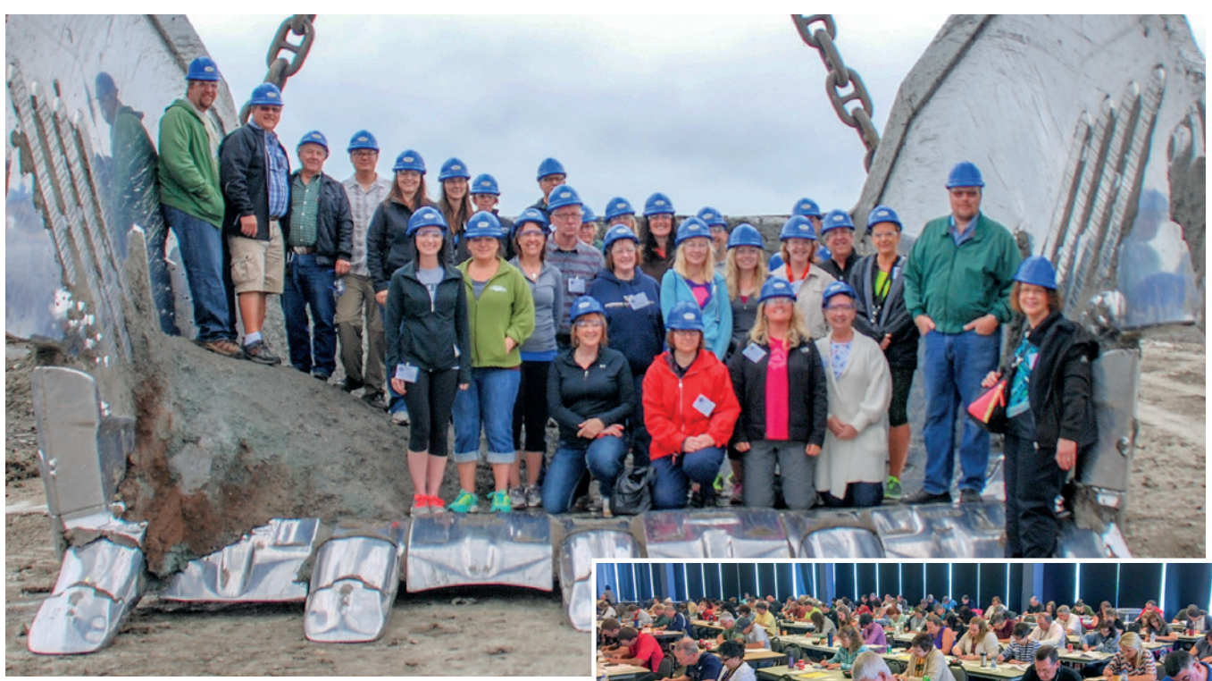
Educators tour the coal mine and get a close look at the dragline bucket.