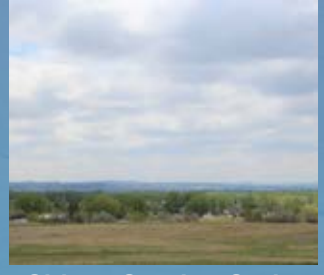
Sidney Soaring Spring