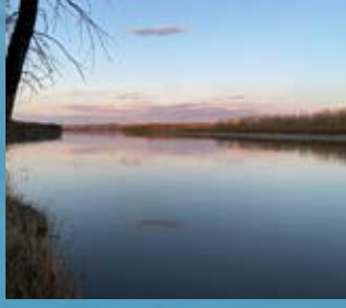
Wishing You Peace