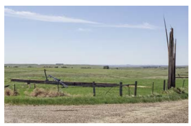
Several laminated poles snapped in the June 10 storm. These poles are rated to withstand 100-mile-an-hour winds with quarter-inch of ice.

Wind and hailstorms are not uncommon in our area. Typically, the storms do not last long or create too much turmoil. However, the storms that rolled through Lower Yellowstone Rural Electric Cooperative's (LYREC) service territory in June brought severe damage to our system.