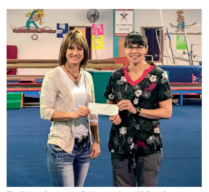
The Sidney Gymnastics Club received $1,100 from Operation Round Up to assist with a building expansion.