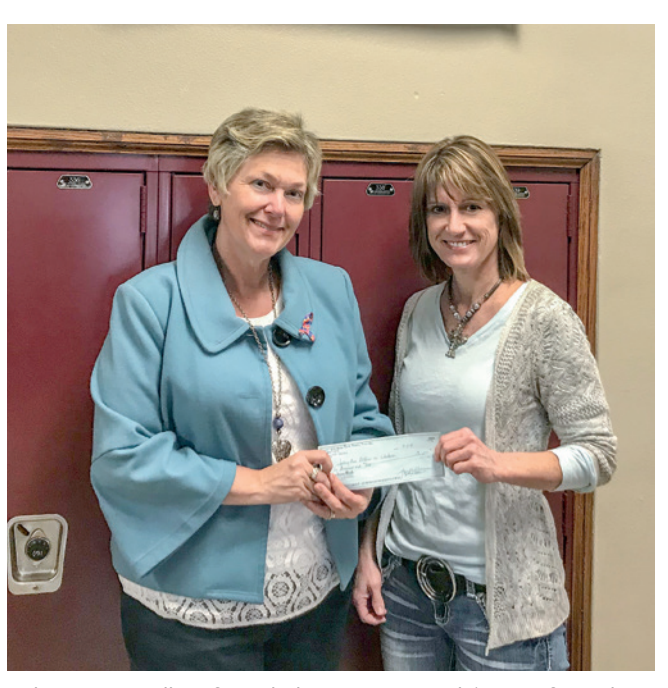
Sidney Area Dollars for Scholars was granted $1,000 from the Operation Round Up Trust that will be used to increase the number of scholarships awarded.