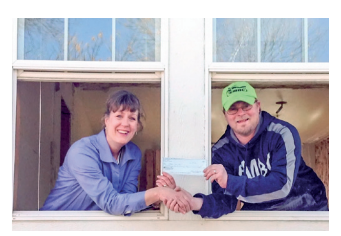
The funds the Eastern Montana Bible Camp Association received from Operation Round Up will be used to update one of the dorms and make it handicapped-accessible.